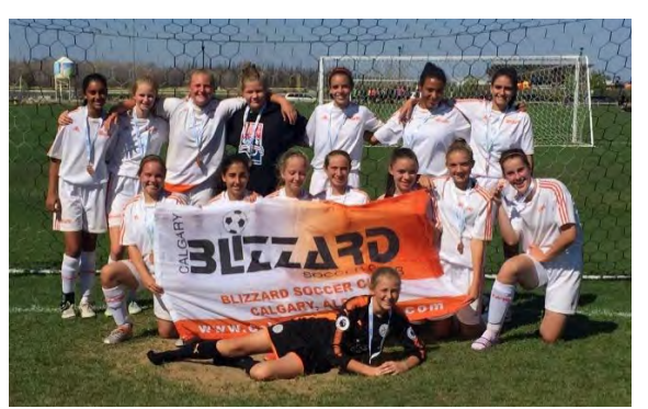
Blizzard Alliance GU14 – Bronze!