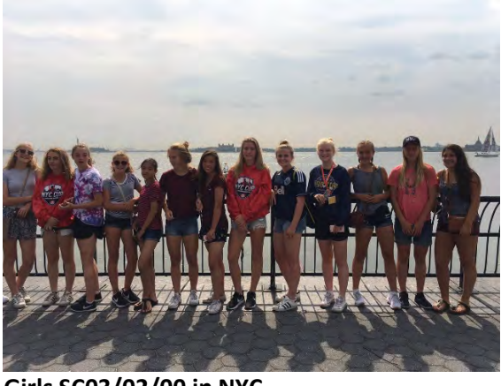
Girls SC03/02/00 in NYC