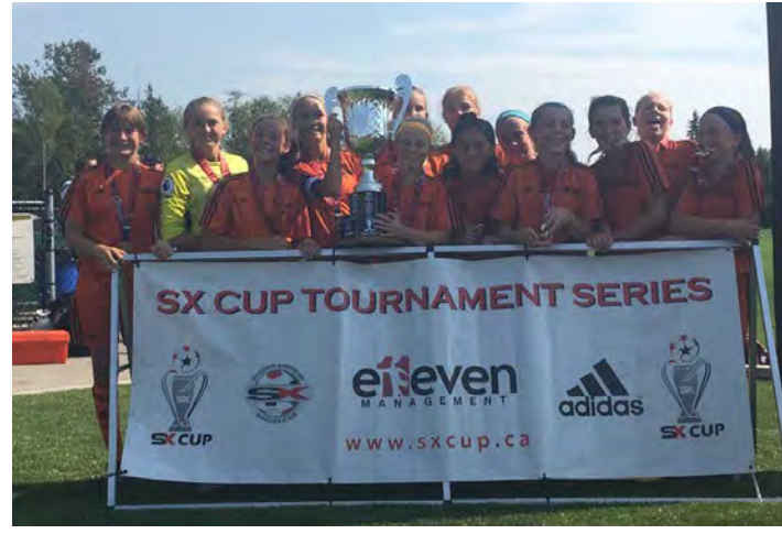
Blizzard Girls SC05 SX Cup Premier Champions!