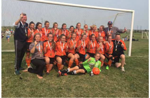
Blizzard Rangers GU18 – Gold!