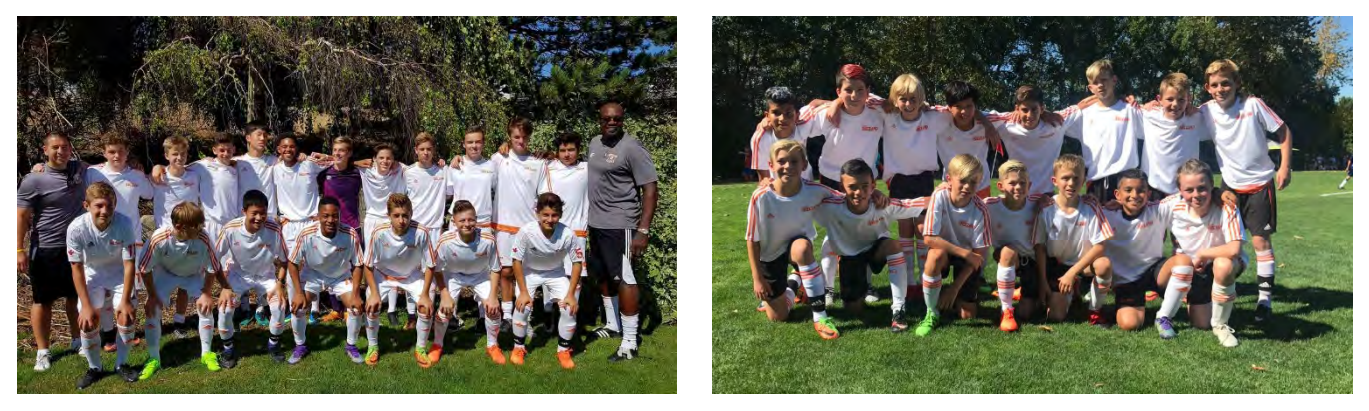
Blizzard SC02 and SC06 Boys in the SX Cup in Vancouver Labour Day Weekend