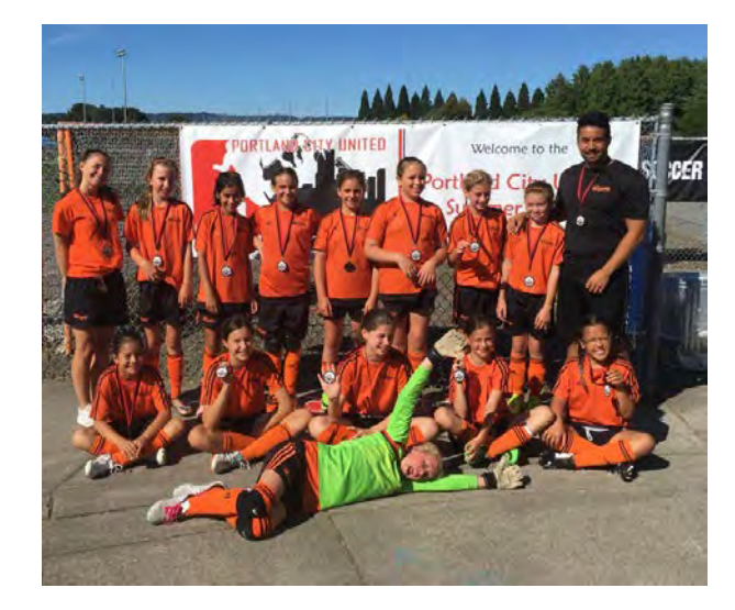
Girls SC04 & 06 in Portland

Girls Alliance 03 at Schwann Cup Minneapolis