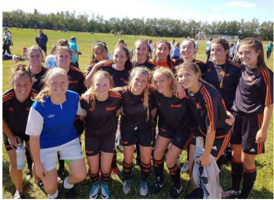
Blizzard SC Women - Silver!