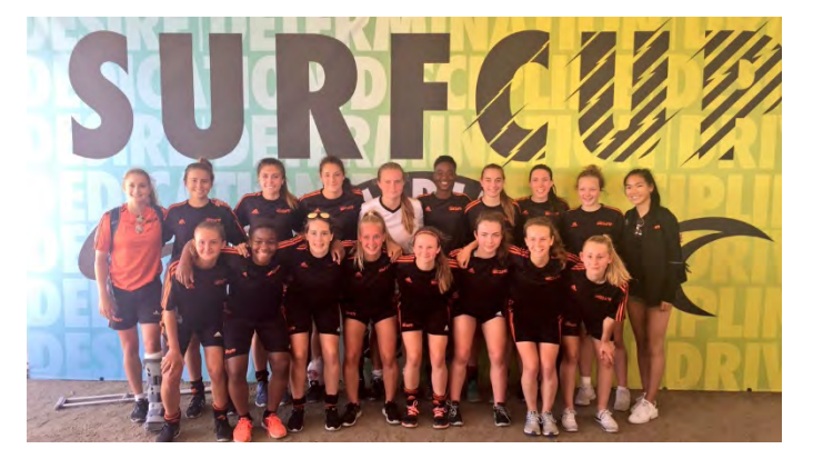
Girls SC01 and Boys Alliance 04 at San Diego Surf Cup